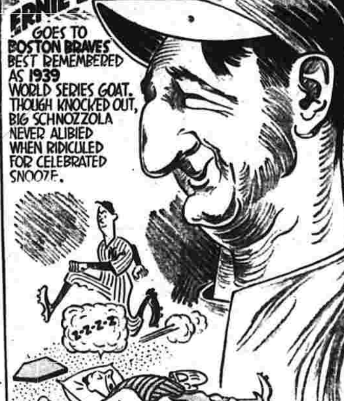
ERNEST LOMBARDI... TOBACCO TO BOSTON BRIVES BEST REMEMBERED AS 1939 TROUGH KNOCKED OUT, TROUGH KNOCKED OUT, NEVER RIBBED, NEVER RIBBED, NEVER RIBBED, NEVER RIBBED.

Manhattan Has His Team Ready for Locals at Rec Tonight; First Game at 7:30 Sharp.